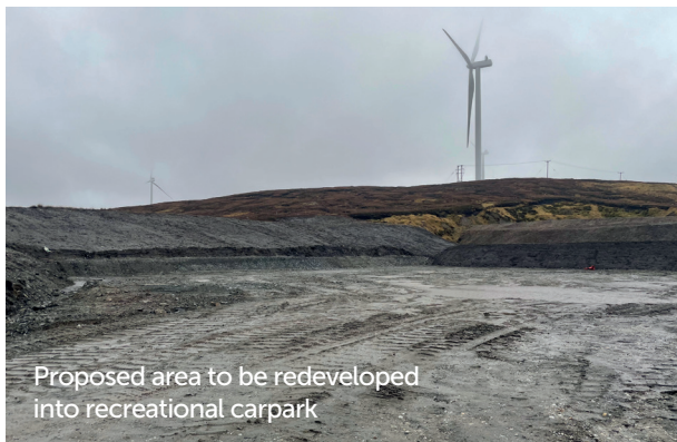
Proposed area to be redeveloped into recreational carpark