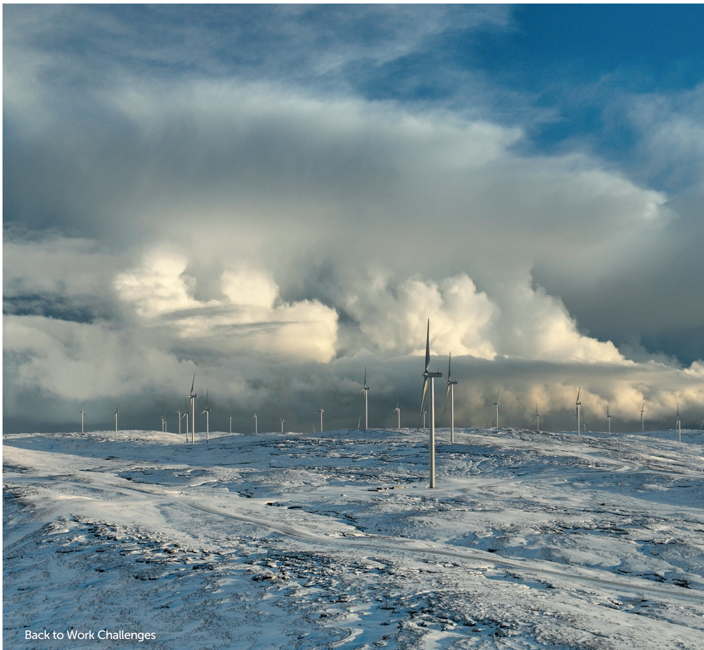
Back to Work Challenges

Water quality monitoring will continue throughout 2024 and in keeping with the applicable planning condition, will continue at least 12 months post commissioning. Similarly, the final season of ornithological monitoring will be carried out in 2024 resulting in a report analyzing the impact of construction works on bird populations and impacts on habitat dispersal.