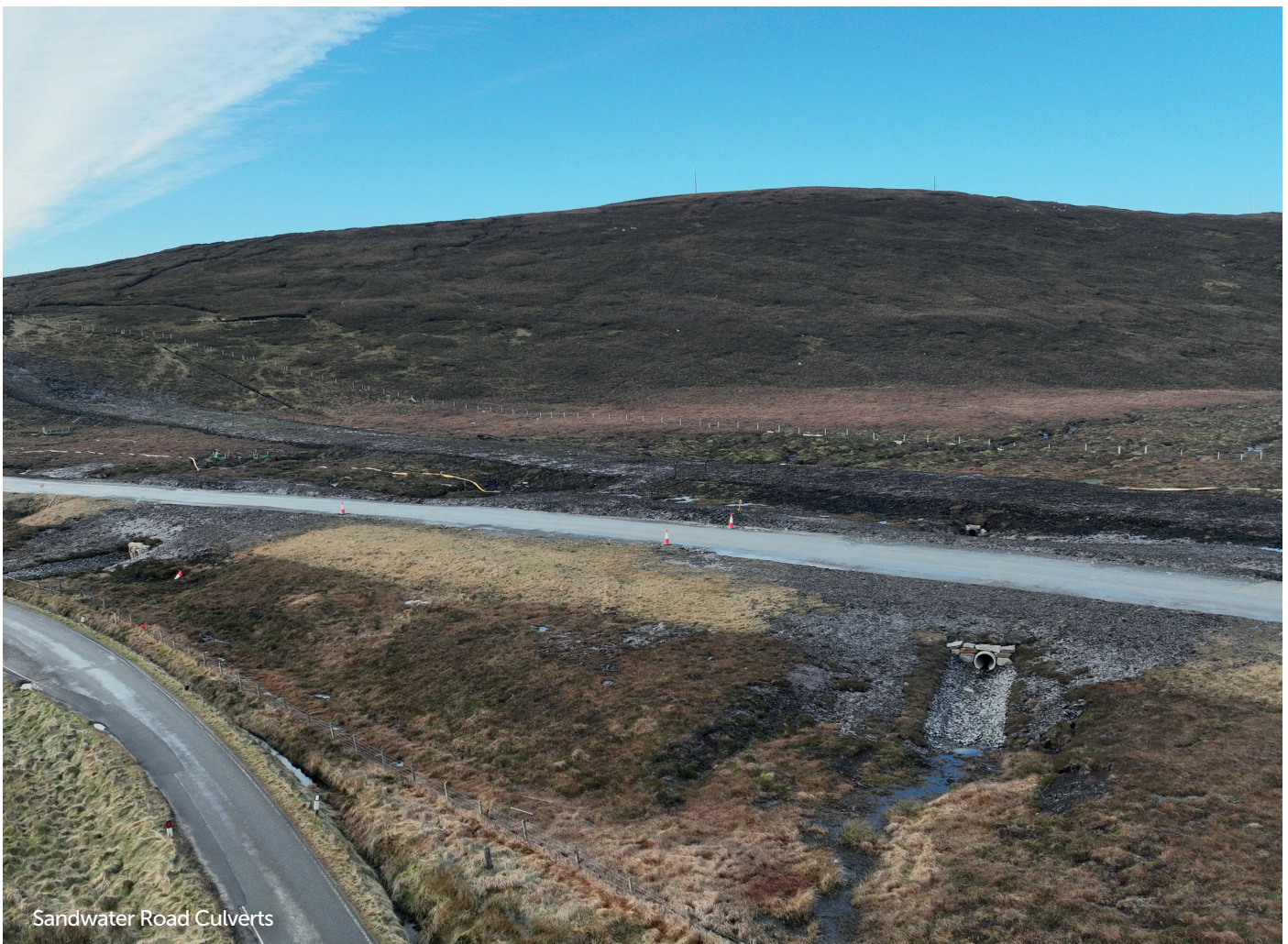
Sandwater Road Culverts

Once the surfacing has been completed white lines, signage, road restraint barriers and the parapet to Pettawater bridge will be installed to bring the road to a standard ready for adoption by Shetland Islands Council. RJM also have ducting to install to both side of the new road before landscaping at the edge of the tar. Final landscaping will then be completed along with the final sections of drainage ditching and drainage ponds to deal with the surface water created by the new tar finish. Upon completion of the landscaping local fencing contractors will install fence lines to keep a boundary between the livestock and traffic using the new road. The new road will be a quicker and most importantly a safer route to drive past Sandwater Loch once open to the public.