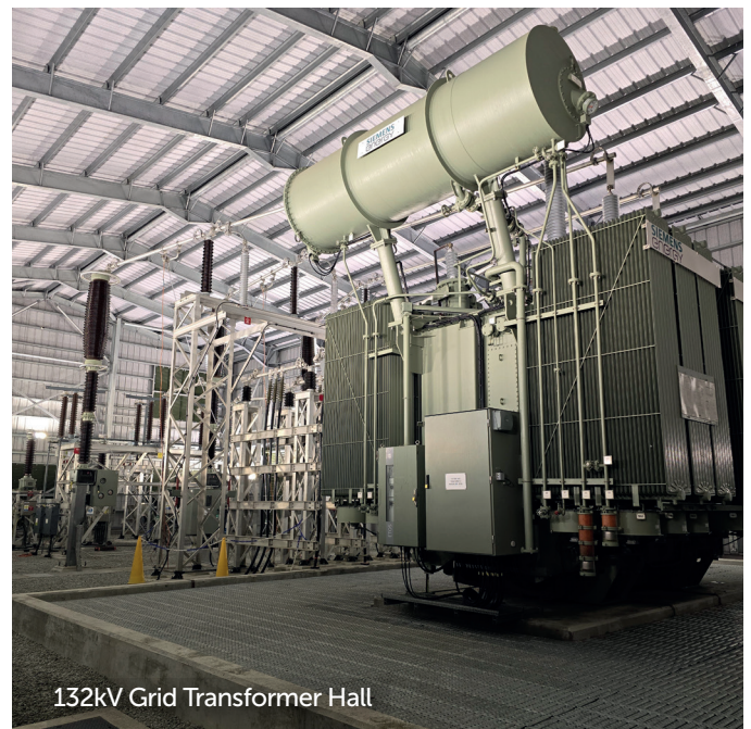
132kV Grid Transformer Hall

Commissioning works have been ongoing over the last 9 months varying from our smaller systems i.e. communications, CCTV, fire and intruder alarm, battery backup systems before commencing with the more onerous high voltage switchgear, Grid transformers, and control and protection systems, these commissioning activities have been spread over the latter months and all leading and contributing to the final stage 2 commissioning