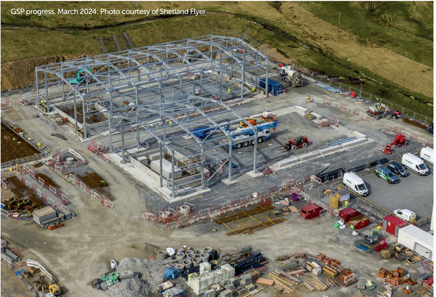
GSP progress, March 2024: Photo courtesy of Shetland Flyer

Gremista GSP update: Below ground concrete works have now all been completed, and the civils team are preparing for the ground level works including concrete slabs. A mobile crane has been on site from March to commence erection of the buildings structural steel frames starting with the transformer buildings, the first of which has been completed. The second transformer building is in progress before the focus moves on to the Control Building. In parallel with the building works, below ground drainage, ducting and earthing will commence from April.