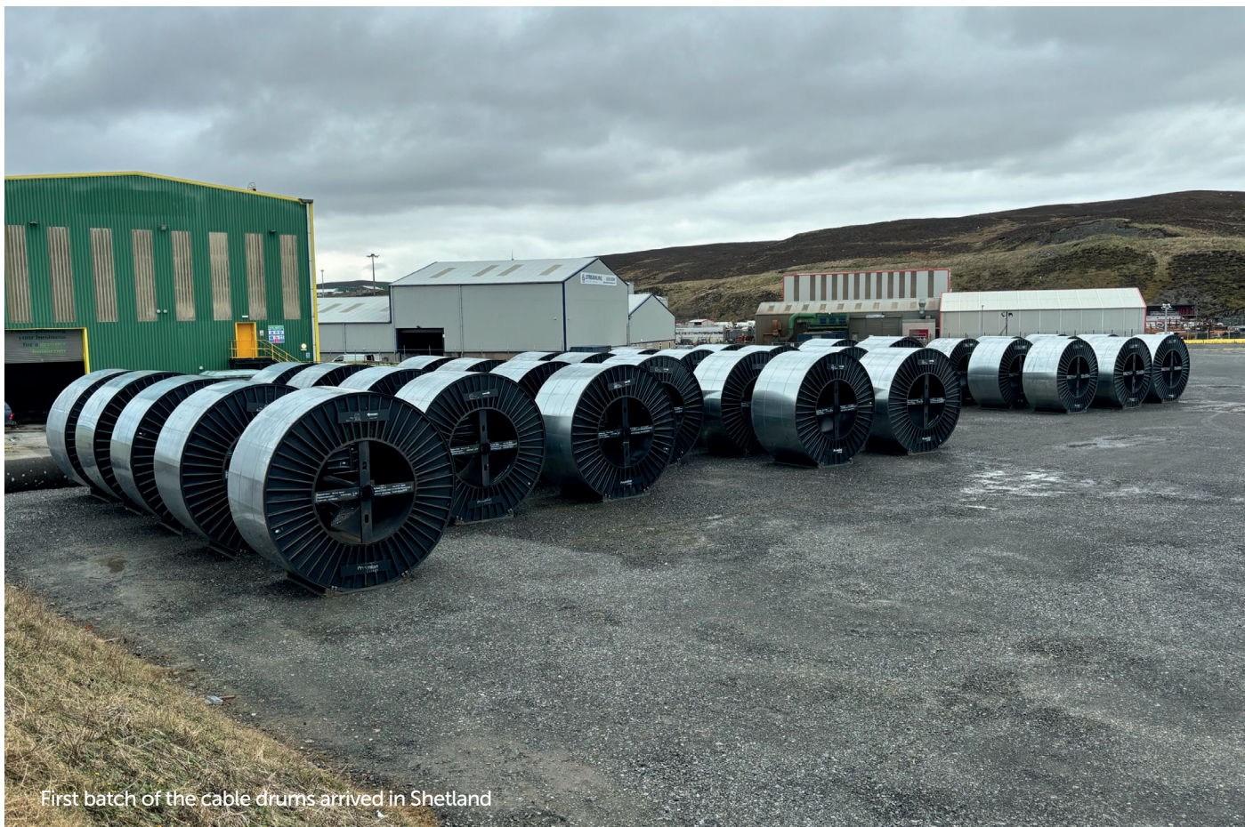
First batch of the cable drums arrived in Shetland

Under Ground Cable update: All 132kV cables have now been manufactured and split into three batches of deliveries, with the first batch successfully delivered to Shetland in March. Batches two and three should be completed by the end of May. We are working closely with a local company to keep the cable drums in storage until they are required.