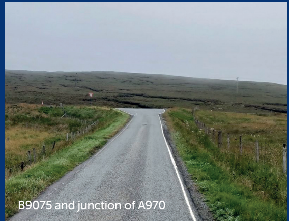
B9075 and junction of A970

In accordance with the planning conditions of the Sandwater Road consent, a temporary carpark is currently in place at Sandwater Road. A further planning condition requires the construction of a permanent carpark at Sandwater Road. It is intended this will be located close to the B9075 and A970 junction. The carpark will provide a safe, public parking area to benefit the local community for commuting and recreation.