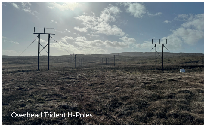
Overhead Trident H-Poles

Wiring works are well underway, with 60 spans now wired at the Northern section of the line near Girlsta.