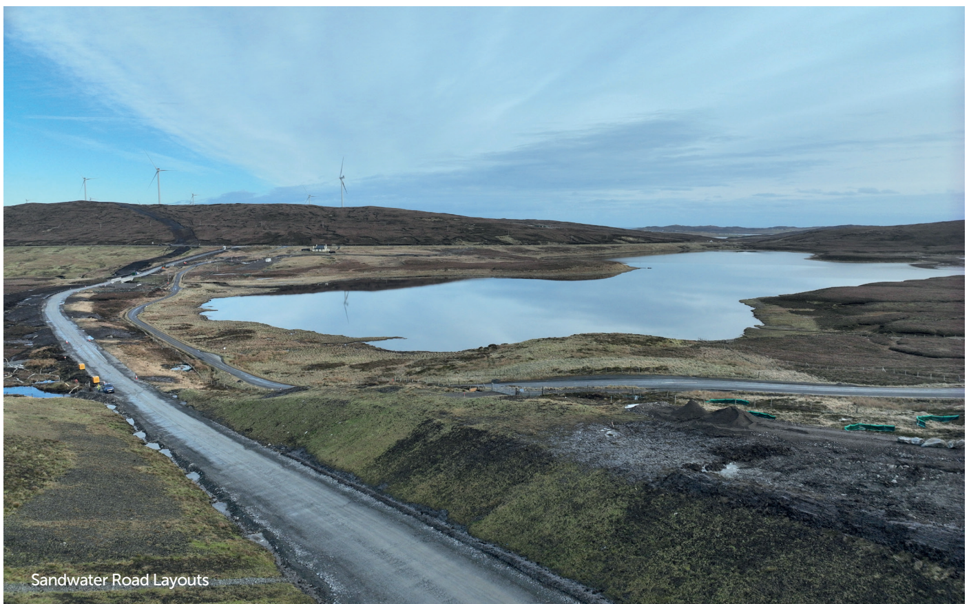
Sandwater Road Layouts