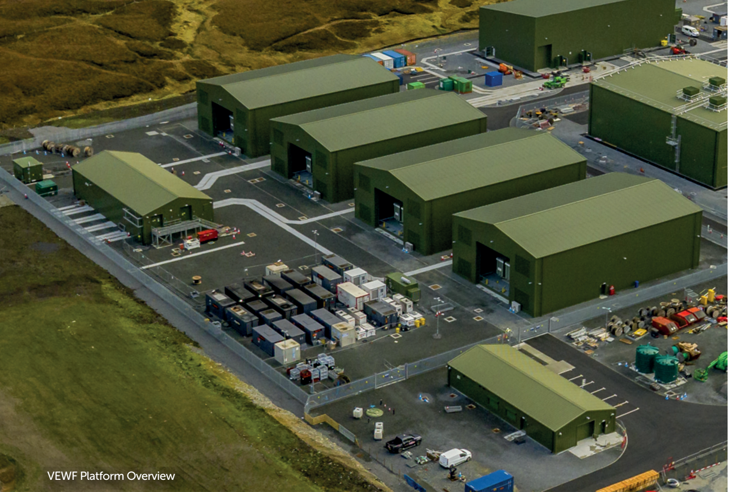
VEWF Platform Overview